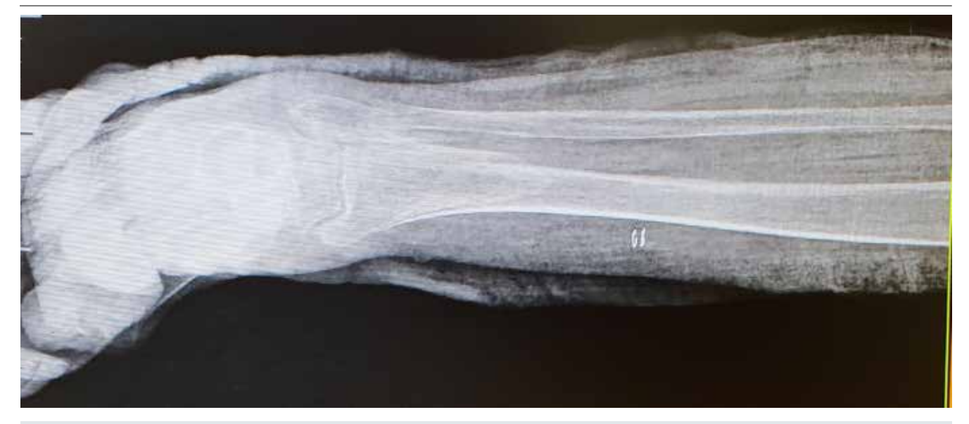
Figure 1. AP radiograph of a patient with distal tibia fracture concomitant with a fibula fracture